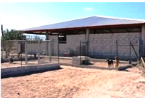
The Baja Dogs Refuge in El Centenario